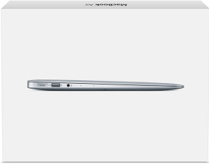
The 13-inch MacBook Air packaging is extremely material efficient, allowing at least 15 percent more units to fit in each shipping container than the original MacBook Air.