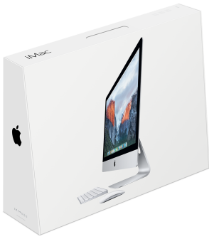
The 21.5-inch iMac retail packaging consumes 53 percent less volume and weighs 35 percent less than the original 15-inch iMac packaging.