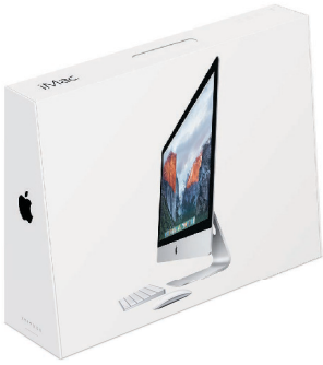
The 21.5-inch iMac retail packaging consumes 53 percent less volume and weighs 35 percent less than the original 15-inch iMac packaging.