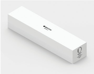
Apple Watch Series 3 (GPS) retail packaging contains at least 39 percent recycled content.