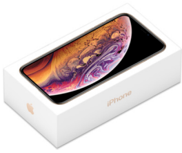
U.S. retail packaging of iPhone Xs contains 54 percent recycled content.