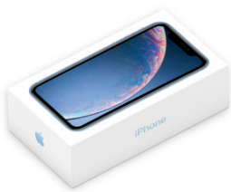
U.S. retail packaging of iPhone XR contains 54 percent recycled content.