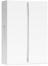
Retail packaging for iPad mini 4 uses a minimum of 38 percent post-consumer recycled content.