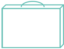
U.S. retail packaging of the 15-inch MacBook Pro with Retina display contains an average of 23 percent recycled content by weight.