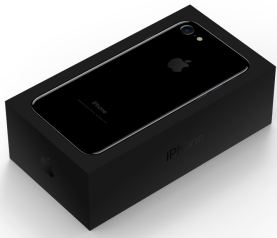
U.S. retail packaging of iPhone 7 contains 84 percent less plastic than the previous-generation iPhone packaging and contains 60 percent recycled content.