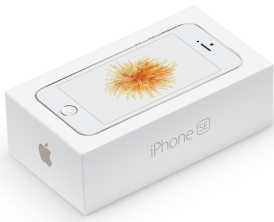
U.S. retail packaging of iPhone SE is 26 percent lighter and consumes 41 percent less volume than the first-generation iPhone packaging.