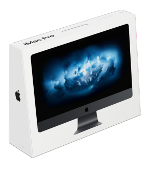
The U.S. retail packaging of iMac Pro contains 78 percent less plastic than the 27-inch iMac with Retina 5K display, and contains 85 percent recycled content.