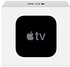
The retail packaging of Apple TV 4K is made from a minimum of 35 percent recycled content.