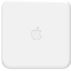
The exterior of the Apple Watch carrying case is composed of 50 percent post-consumer recycled polycarbonate.